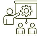
SEL YOUTH DEVELOPMENT TRAINING (SACE ACCREDITED)